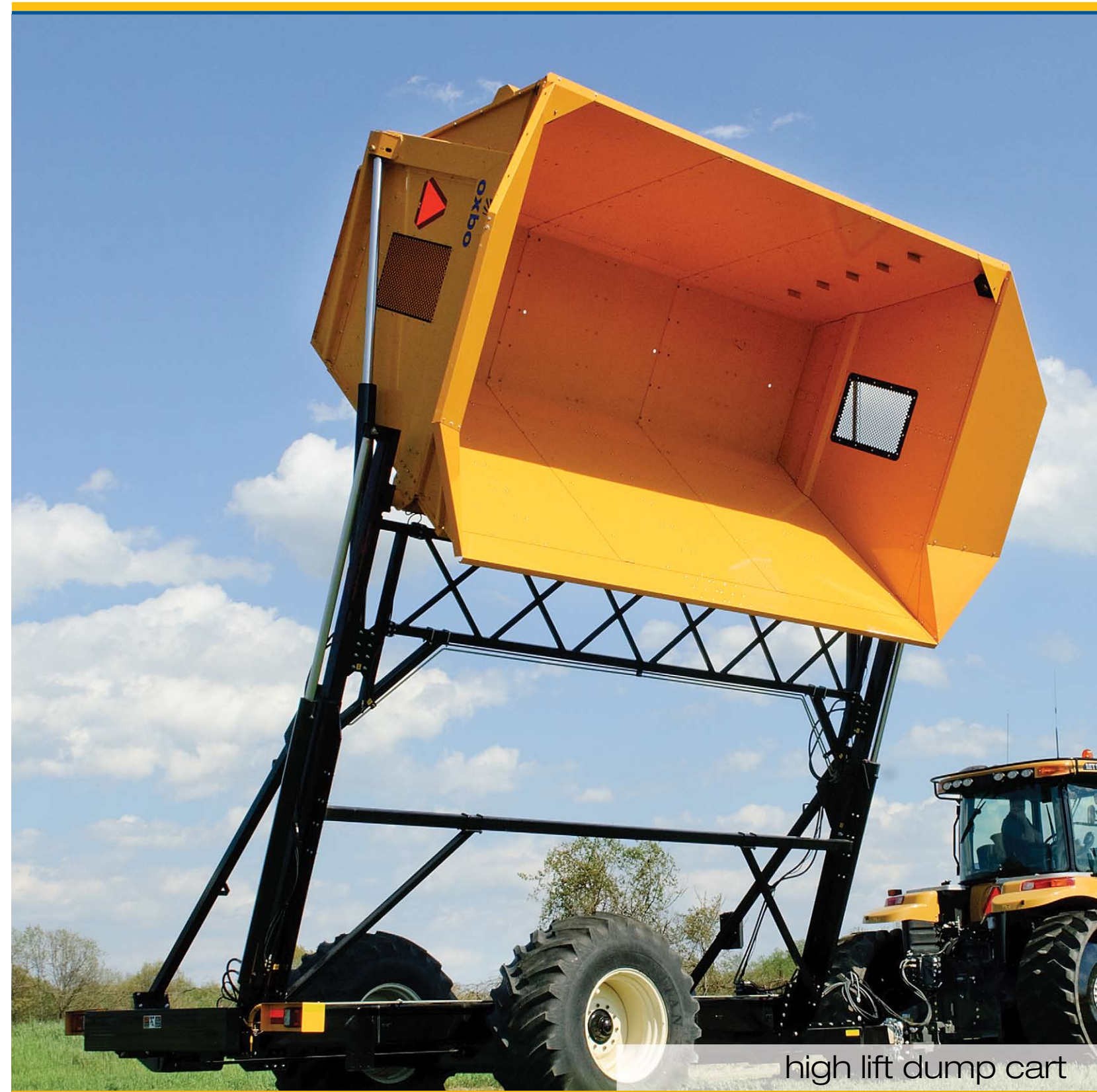
high lift dump cart

** Tire size and/or options will vary shipping weight and dimensions (ballast weight is included in the shipping weight)